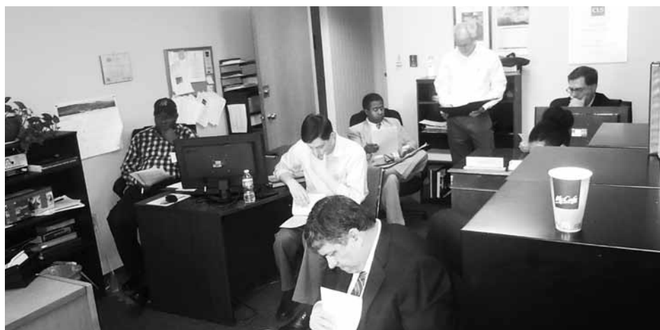
Various volunteer attorneys reviewing mortgage documents