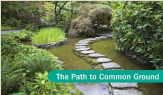
The Path to Common Ground